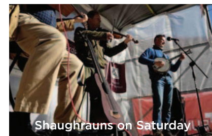
Shaughrauns on Saturday