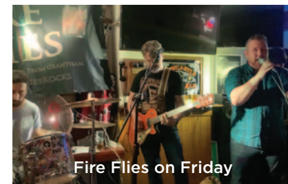
Fire Flies on Friday

For more information visit us at... www.sheepfair.co.uk