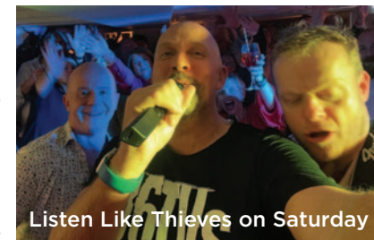
Listen Like Thieves on Saturday

Remember that not all stalls have card machines, so bring some cash with you to enjoy the weekend!